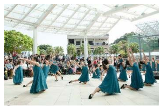
30 young talented HKYAF dancers perform for packed crowds.